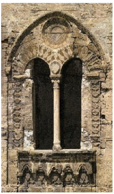
1 From Trabia, C. (2004): not dated, cited as being a tower window in Sicily.

Assemble the frame using the connectors and the diagram below.